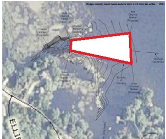
Area of Proposed Dredging in Round Pond

With an estimated project cost between $70,000 - $100,000, the LRA has determined that it must embark on a fundraising campaign to pay for the dredging project. While we maintain a Lake Restoration Fund to be accessed for purposes such as this, the costs are far beyond what we can spend from that, without depleting the fund to a perilously low level. We are thus relying on you, our lake community members, to come together and support this vital initiative to "Rescue our Lakes." We are seeking at least $50,000 from our membership and from local businesses. The remainder will come from the Lake Restoration Fund and, hopefully, local grants which we are currently pursuing. If we achieve a total above our goal, that will go toward re-building our fund. This is the first fundraising campaign that has ever been conducted in LRA's 80-year history. Because of careful stewardship of