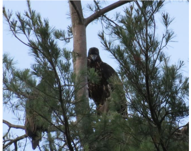
The fledglings in their tree on Lake Rescue

--Bald Eagles fledge (fly) at about 10-14 weeks. Prior to their first flight, nestlings will flap their wings in the nest or while jumping to an adjacent branch, a behavior known as 'branching'.