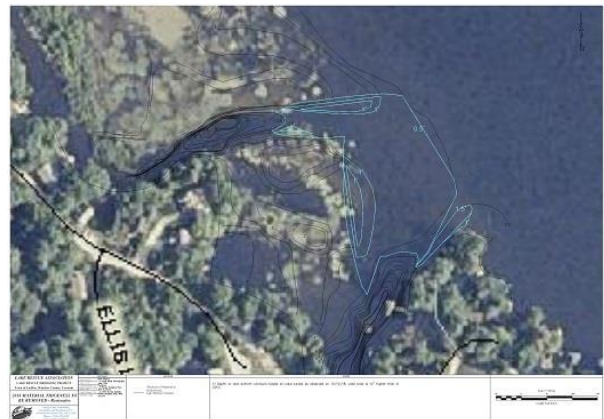
Sedimentation at the mouth of the Black River

Additionally, LRA is discussing several areas along East Lake and Ellison's Lake Road which might qualify for a Better Roads grant. This project could include stabilizing streams leading into the lake, additional diversion of runoff and lining swales along the roadway with rip-rap. The Board has sent a letter to the Town of Ludlow highlighting the areas that need attention and a site visit is being scheduled in November. The application for a Better Roads grant is due on November 22, 2019 and if approved the work would be performed in 2021.