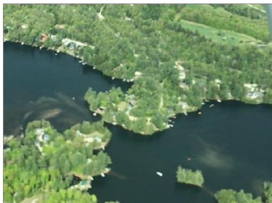
Aerial View of Narrows in 2020