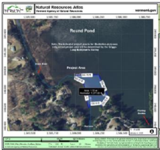
Area of Dredging for October 2023

This will continue to be an ongoing issue for our lakes because of road conditions around the lake and the steep terrain beyond the roads. The LRA is committed to striving for long term solutions, such as the ongoing Better Roads projects (see the Sedimentation article, below) and improved shoreland conditions on properties around the lakes (see the LakeWise article on p. 4). Thank you for partnering with us to preserve these beautiful lakes for our grandchildren!