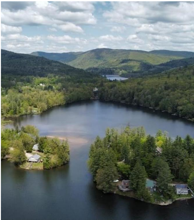
We plan to dredge the river channel, including part of the sand bar, in Round Pond this fall.

We are grateful that our lake water is returning to its previous clarity, despite taking another beating during a December rain storm.